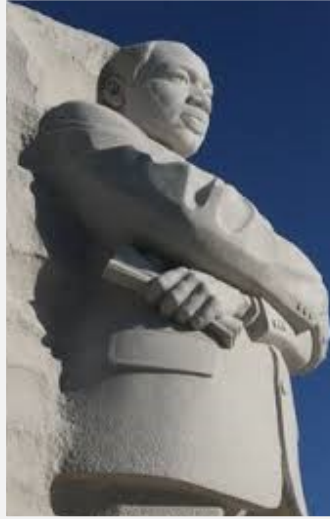
Martin Luther King Jr. memorial in Washington D.C.